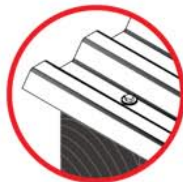
TIMBER APPLICATION TIMTAPP®