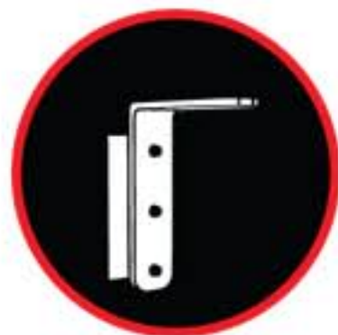
CONCRETE APPLICATION CONTAPP®