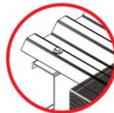
DUO APPLICATION DUOTAPP®